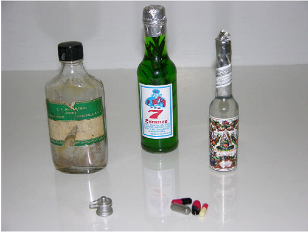
Fig. 1 – Foreground left: amalgam icon — Parad Shivling. This item weighed 10 g and emitted 0.3 \mu\text{g}/\text{h} \text{Hg}^0 vapor at 24 °C. Foreground right: gelatin capsules containing \text{Hg}^0 . The clear capsule contains 9 g \text{Hg}^0 and was purchased in the study area for $1.00. We purchased the colored capsules in the Dominican Republic at a similar cost. Rear left: bottle of elemental mercury. This bottle contains approximately 2 kg \text{Hg}^0 and was the source of spilled Hg in the reference community (C1). Rear center and right: Agua de Florida, and 7 Escencias. We purchased these items in the Dominican Republic also. The store clerk suggested we mix these items with mercury from the capsules and apply the mixture to floors in the home twice per week. These products typically contain water, alcohol, and essential oils. We do not believe they contain mercury though we did not analyze them.

We found the \text{CO}_2 concentration in building common areas ( 555 \pm 140 ppm) to be approximately double that of outdoors ( 255 \pm 44 ppm) with an average \text{CO}_2 in/ \text{CO}_2 out ratio of 2.2 (SD \pm 0.6 ). This ratio did not significantly differ between C1 ( 2.1 \pm 0.7 ) and S1 ( 2.3 \pm 0.4 ) (t-test, p=0.13 ).