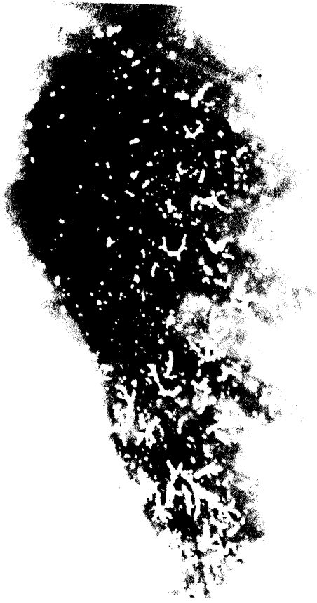
Figure 2. Close-up Roentgenographic View of the Mercury-Filled Arborizing Vasculature of the Left Lower Lung.

evidence of renal or hepatic damage. A roentgenogram obtained 11 months after the initial insult still showed residual metallic densities in both lung fields.